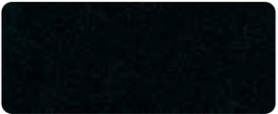
Black 59 in — 102 in F3933-00002