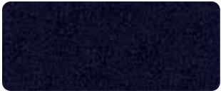
Navy 59 in F3933-10235