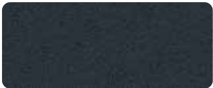
Charcoal 59 in F3933-20166