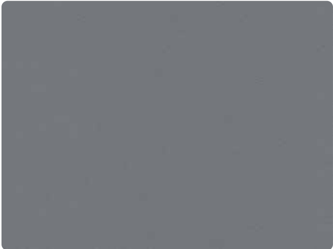
Cloud grey 59 in F3933-20218

Crew protection with a double-sided coating